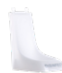
XIBU disinfectWALL Art.-No. 4110600550

Mobile floor stands for disinfection dispensers. Ideal for entrance areas in restaurants, hotels, nursing homes, hospitals etc.