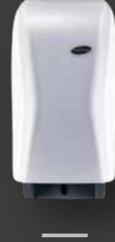
XIBU TISSUEPAPER hybrid* TOILET PAPER DISPENSER