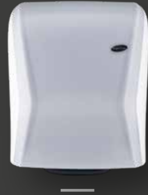
XIBU TOWEL hybrid* PAPER TOWEL DISPENSER

Innovative hybrid concept: always ready to use.